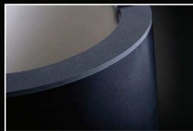
Durable End Cap