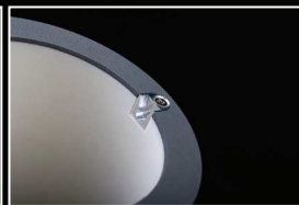
Durable & precise registration Aluminum insert