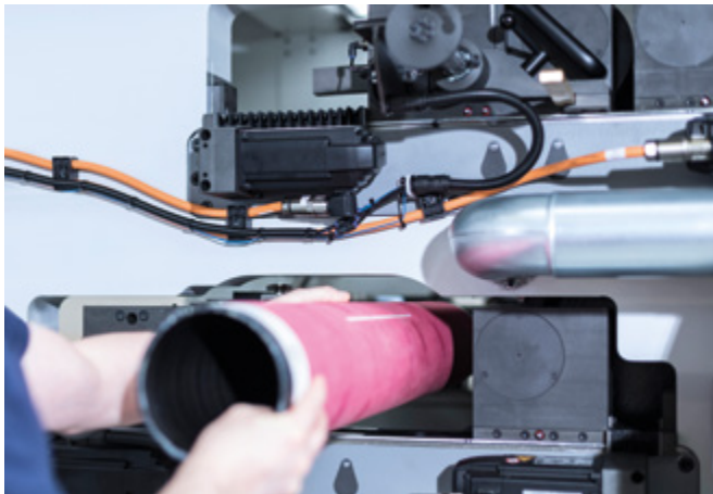
Minimal changeover times thanks to perfect accessibility to the printing units.