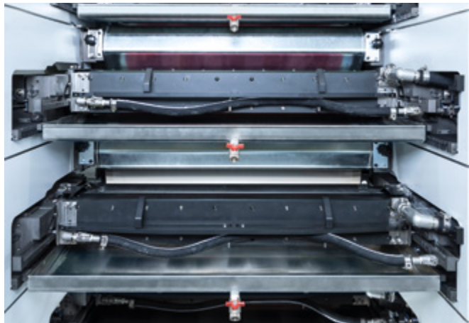
A solid design with 100 mm steel sideframes and outstanding stability as standard.